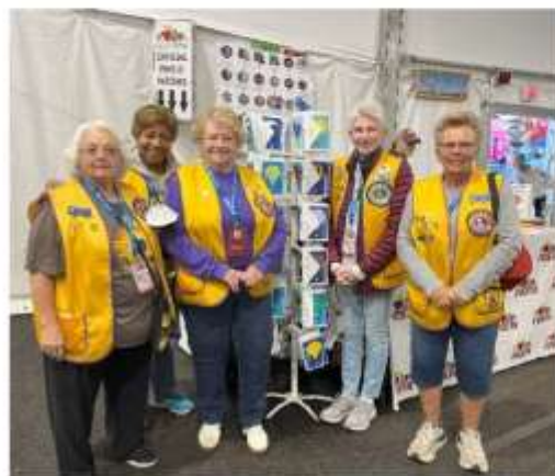
Day 2 Team

table, selecting Fiesta Pins/Patches (popular items) for the customers. When the doors opened at 5am, people quickly lined up at the pin table to select their items. They purchased caps, t-shirts, sweatshirts, calendars, posters, cups/glasses and more. These were purchases before the Mass