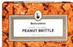
Peanut Brittle Buttery, crunchy and irresistible. 1 lb 8 oz $29.00 #500355