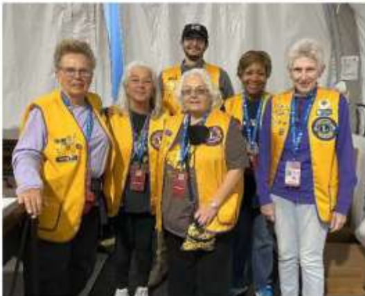
Day 1 Team