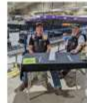
American Legion Riders Volunteering their Services