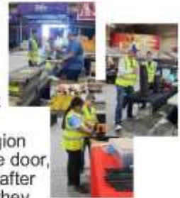
JROTC Volunteering To Load Vendors