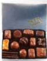
Silver Assorted An assortment that shines on its own. 8 oz $16.50 #500474