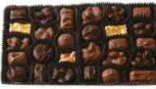
Nuts & Chews Yummy, crunchy and chewy. Delivered in seasonal wrap. 1 lb $29.00 #550334 2 lb $55.00 #550335