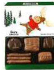
Merry Moose Box An irresistible treat. 3.5 oz $11.00 #506946