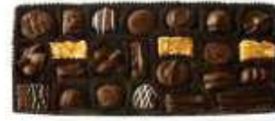
Dark Chocolates A taste of cacao in every bite. Delivered in seasonal wrap. 1 lb $29.00 #550330