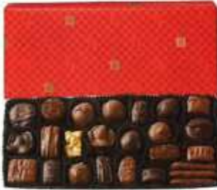
Assorted Chocolates Milk and dark decadence. Delivered in seasonal wrap. 1 lb $29.00 #550318 2 lb $55.00 #550319