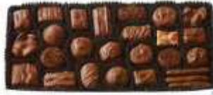
Milk Chocolates Pure milk chocolate goodness. Delivered in seasonal wrap. 1 lb $29.00 #550326