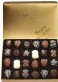
Truffles Wonderfully decadent and rich. 1 lb $32.00 #500902