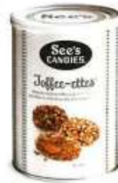
Toffee-ettes® Crunchy toffees, milk chocolate & almonds. 1 lb $29.00 #500316