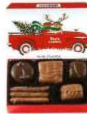
Dashing Delivery Box The ultimate stocking stuffer. 3.5 oz $11.00 #506944