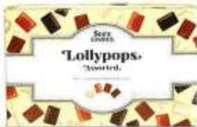
Assorted Lollipops Vanilla, Butterscotch, Café Latté & Chocolate. Approximately 30 lollipops. 1 lb 5 oz $28.50 #500296