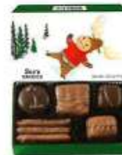
Merry Moose Box An irresistible treat. 3.5 oz $11.00 #506946