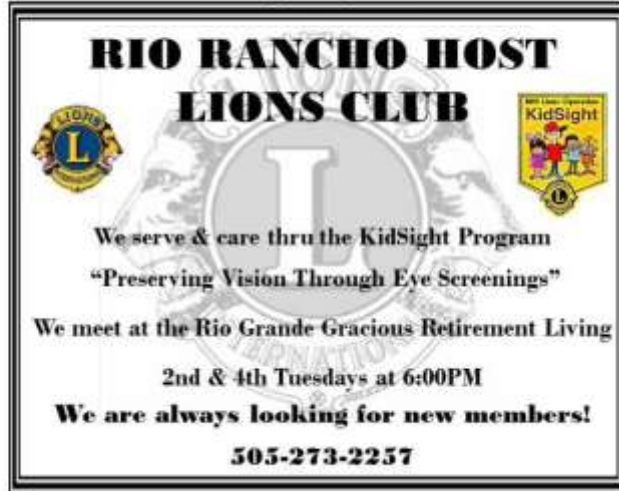
1/4 Page or Business Card Ad