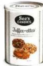
Toffee-ettes® Crunchy toffees, milk chocolate & almonds. 1 lb $29.00 #500316