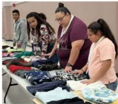
Volunteers had warm sweaters for the guests.