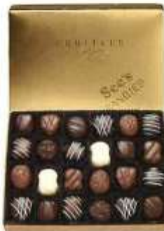
Truffles Wonderfully decadent and rich. 1 lb $32.00 #500902