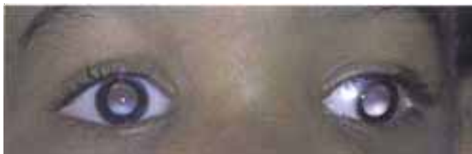
Strabismus -Exotropia OD