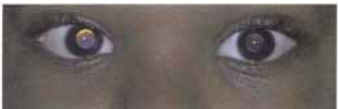
Strabismus -Esotropia OD