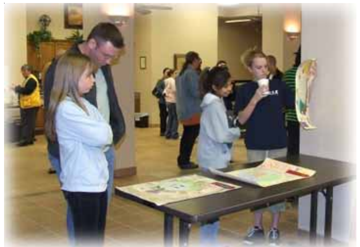
Attendees at the reception view the winning posters.