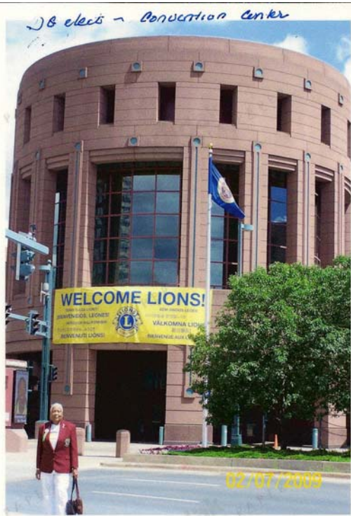
Rosa with DG from NY