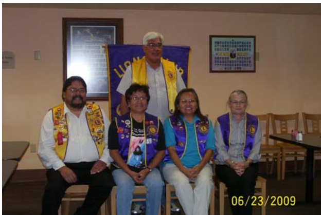
Window Rock-Ft. Defiance Lions Club Lions Officers for 2009-2010.