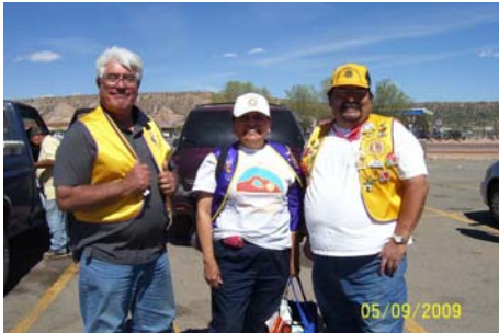
At Left: Lions working at the Flea Market.