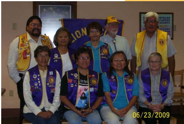
Member of the Window Rock-Ft. Defiance Lions Club gather to install new officers for 2009-2010.