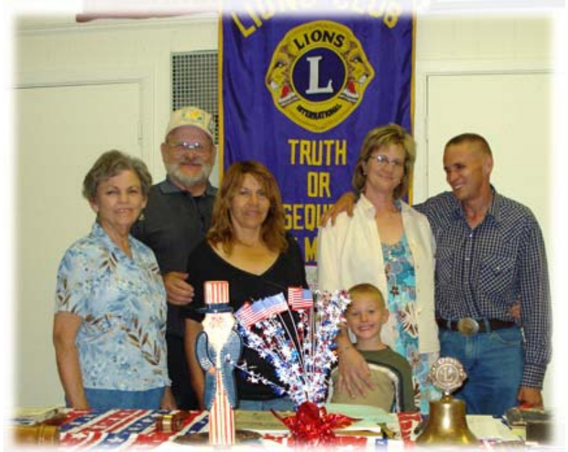
Pictured are the Club's newest Lions who were recognized during the Awards Night program.

The Elephant Butte Chili Cook-off is held at Elephant Butte Lake each June and proceeds benefit the community service projects of both the T or C Lions and the Elephant Butte Host Lions. This year's event once again drew cooks from near and far, each with their own version of the spicy and popular dish.