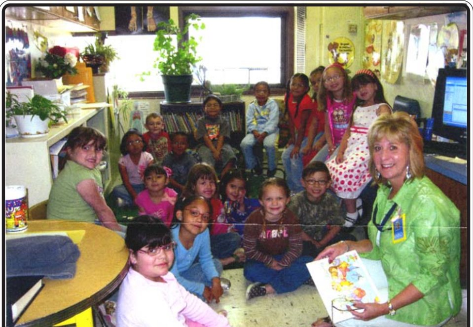
NOB HILL'S EYE POWER CLUB 2007/2008