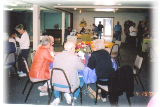
Residents enjoying the pancake breakfast.