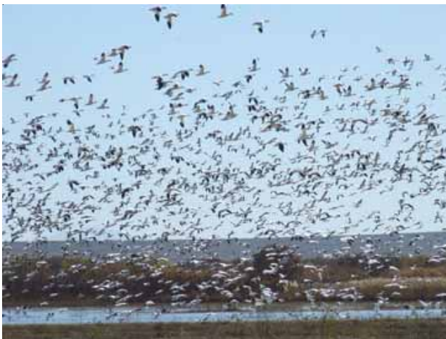
"Flight" Bosque del Apache National Wildlife Refuge Rio Grande River, Socorro, NM Wetlands must be preserved and protected throughout the world if our children are to experience sights such as this.