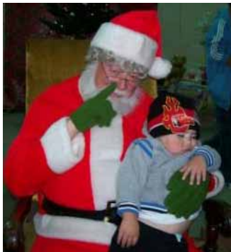
This little tyke never woke up during his visit with Santa.