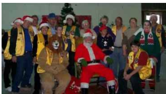
A tired but happy group of Lions gather at the end of a very rewarding day.