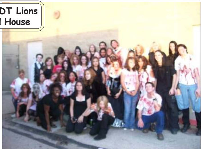
All the students from the Mummies that make our Haunted House a success.