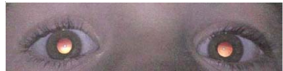
Myopia - Nearsightedness