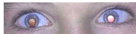
Coloboma - A hole in one of the structures of the eye