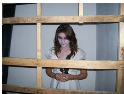
Some of our High School Mummies who work our haunted house. Aren't they scary?