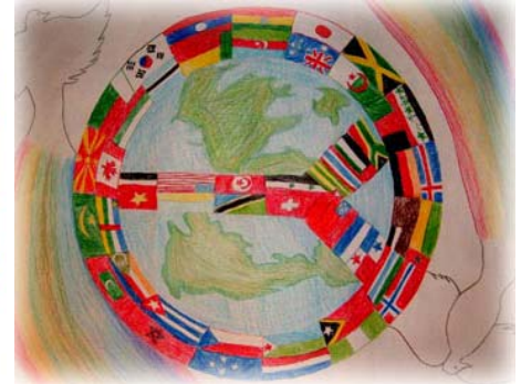
Runner Up - Sky Poncho