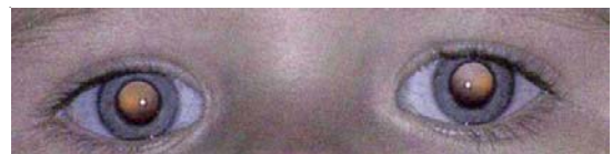
Hyperopia - Farsightedness