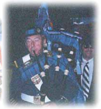
A bagpiper leading the procession.