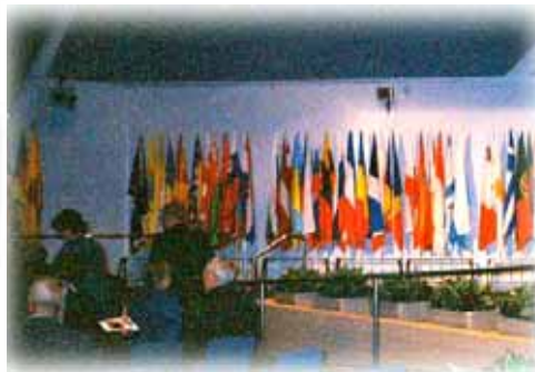
Presentation of flags on first day.