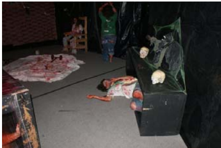
A couple of Mummies in our torcher chamber.