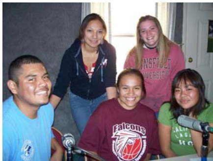
Students recorded a commercial spot advertising the parade at KHAC radio station.