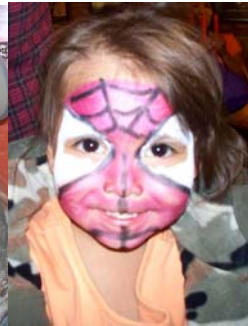
Face painting examples.