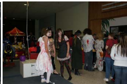
Our dead tour guides.

This is one of our great money makers. The Carlsbad High School Theater Arts (Mummies) Kids decorate our haunted house and do all of the acting and are our tour guides. We build it and they will come! :) Ten Lions worked after work for two weeks to get this thing built in the Carlsbad Mall. There were seven scary rooms that took awhile to get through. It was open for two nights (Eighteen Lions manned the doors) and we saw 1,044 people and collected 37 pair of eye glasses. We then make a donation to the Mummies for helping us. They do this for a grade for their Theater Arts class at the high school. They are really scary and did a wonderful job. It comes down much faster that it goes up (seven Lion and only two days after work). This is our seventh haunted house.