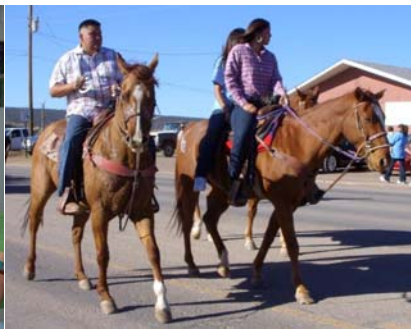
Horses were part of a parade entry.