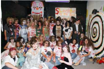
The Carlsbad High School Mummies that act in our haunted house.