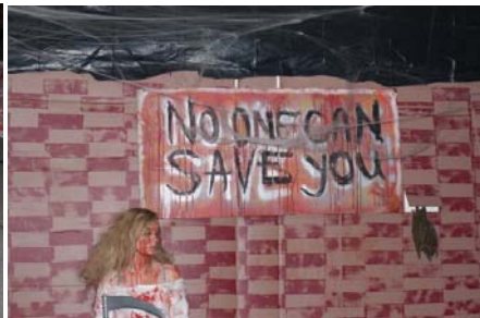
These kids really do a great job decorating.