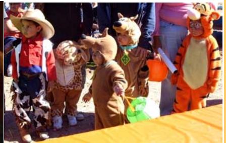
Children's costume contest entrants.