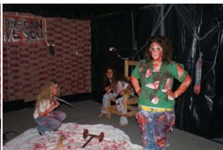
These kids are great at makeup.