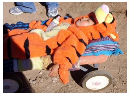
Sleeping child after contest was over. Too sleepy to bounce.