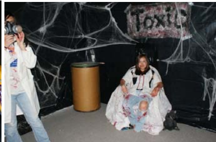
A couple of Mummies in the gas chamber room.