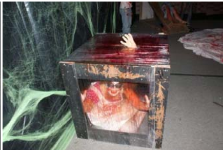
Can anyone help her out?