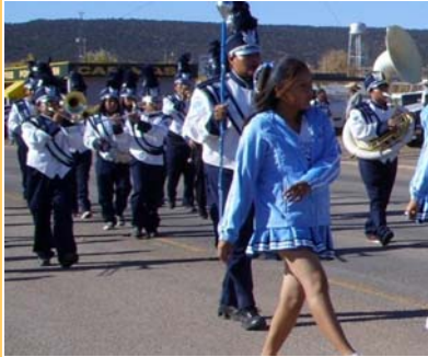
Marching band and cheerleaders.