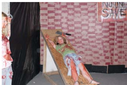
More torcher chamber.