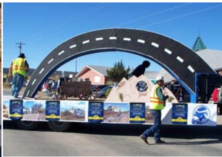
Navajo Division of Transportation parade entry won "Best Commercial"