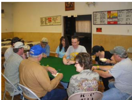
Poker players hoping to make it to the end.

The Carlsbad Downtown Lions held another Texas Holdem' Poker Tournament this past weekend at the Knights of Columbus Hall in Carlsbad, New Mexico. There was a great turn out and lots of fun had by all.