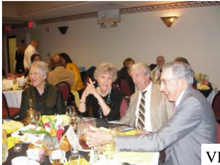
Sandia Mountain Lions enjoying dinner