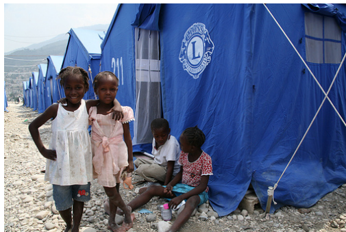
Lions Tent City Near Port-au-prince

Three tent cities were established in the Port-au-prince area. Lions are working to fully equip the cities with sanitation, kitchens, and health clinics. The need in Haiti will be great for many more years, and LCIF efforts will help ensure that communities, lives, and families will be rebuilt.