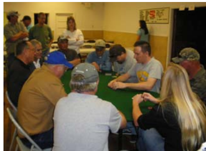
The final table!!!!